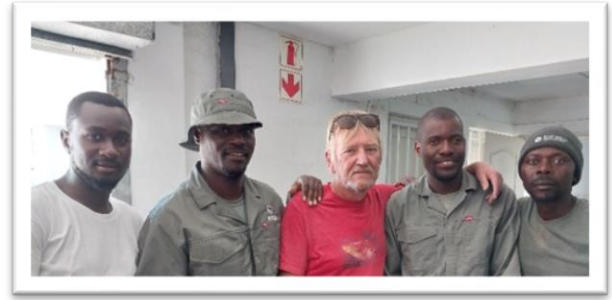
MMID Environmental Upgrading & Maintenance Team