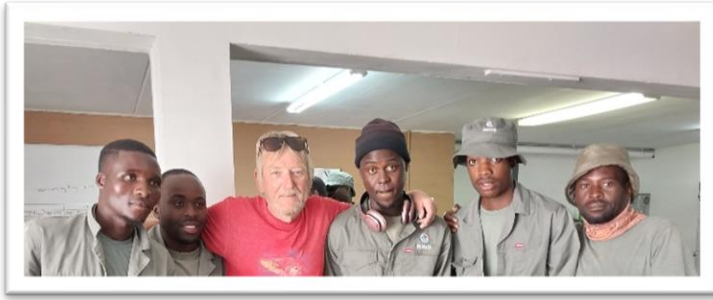
MMID Cleaning Services Team